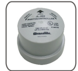
Optional photo control

Dusk to Dawn Fixture of the future is here. Utilizing a single source LED, this dusk to dawn provides prismatic-designed light output for any environment. It comes with NEMA approved Photocontrol which used with LED provides significant power savings. Maintaining all the strengths of the traditional dusk to dawn fixtures such as installation brackets and arms while utilizing the latest generation of LEDs, this LED dusk to dawn will last for years to come.