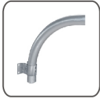
Aluminum anodized arm